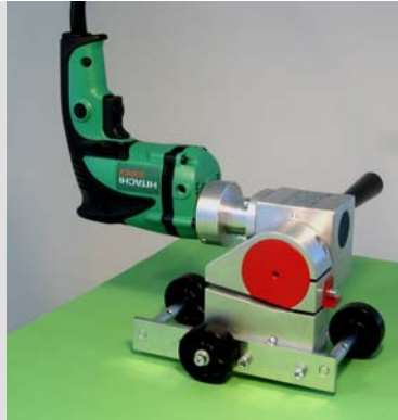
WITH ELECTRIC DRIVE